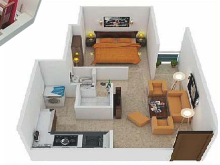
1BHK - Floor Plan Size 640 Sq.Ft.