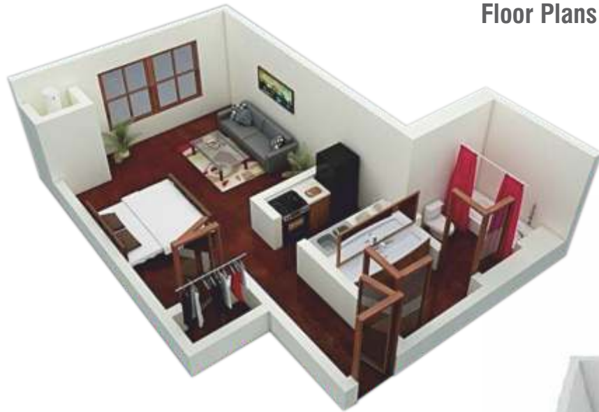
Studio Floor Plan Size 350 Sq.Ft.