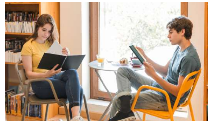
Reading Area with abundant natural light