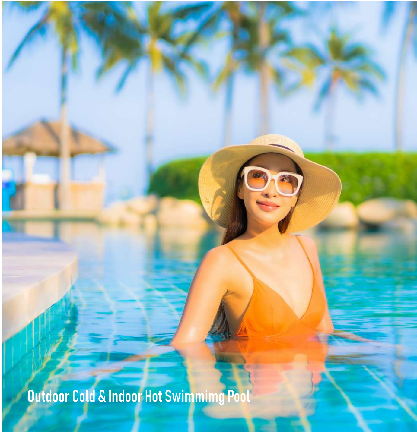
Outdoor Cold & Indoor Hot Swimming Pool