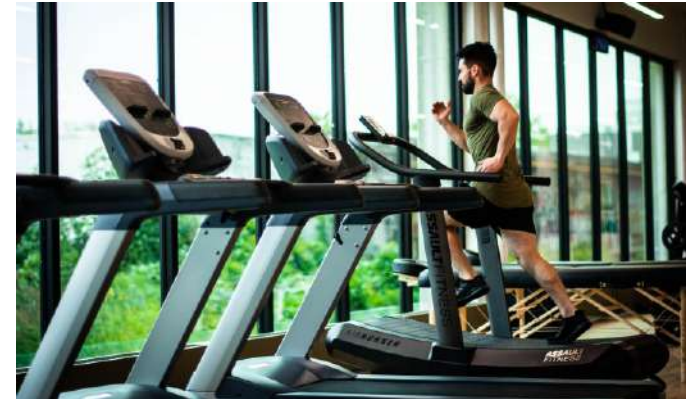
A Large Gym with state of the art equipment